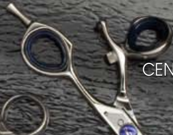
CENTRIX V2 500