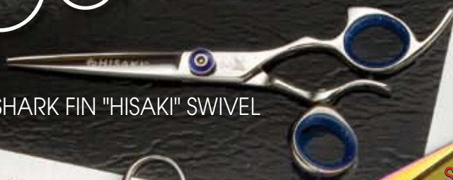
SHARK FIN "HISAKI" SWIVEL