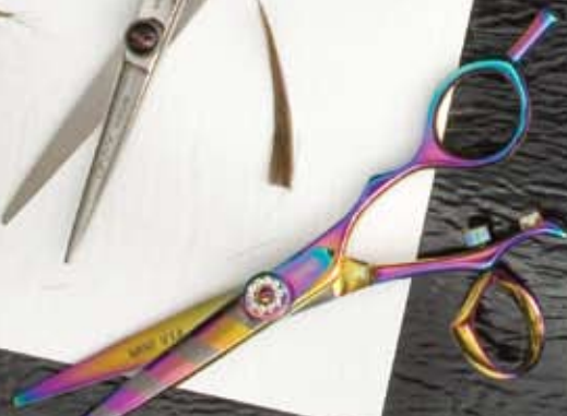
WASHI ZEBRA TITANIUM R AINBOW SWIVEL