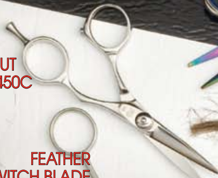
FEATHER SWITCH BLADE SHEARS