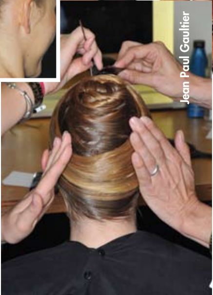
Jean Paul Gaultier