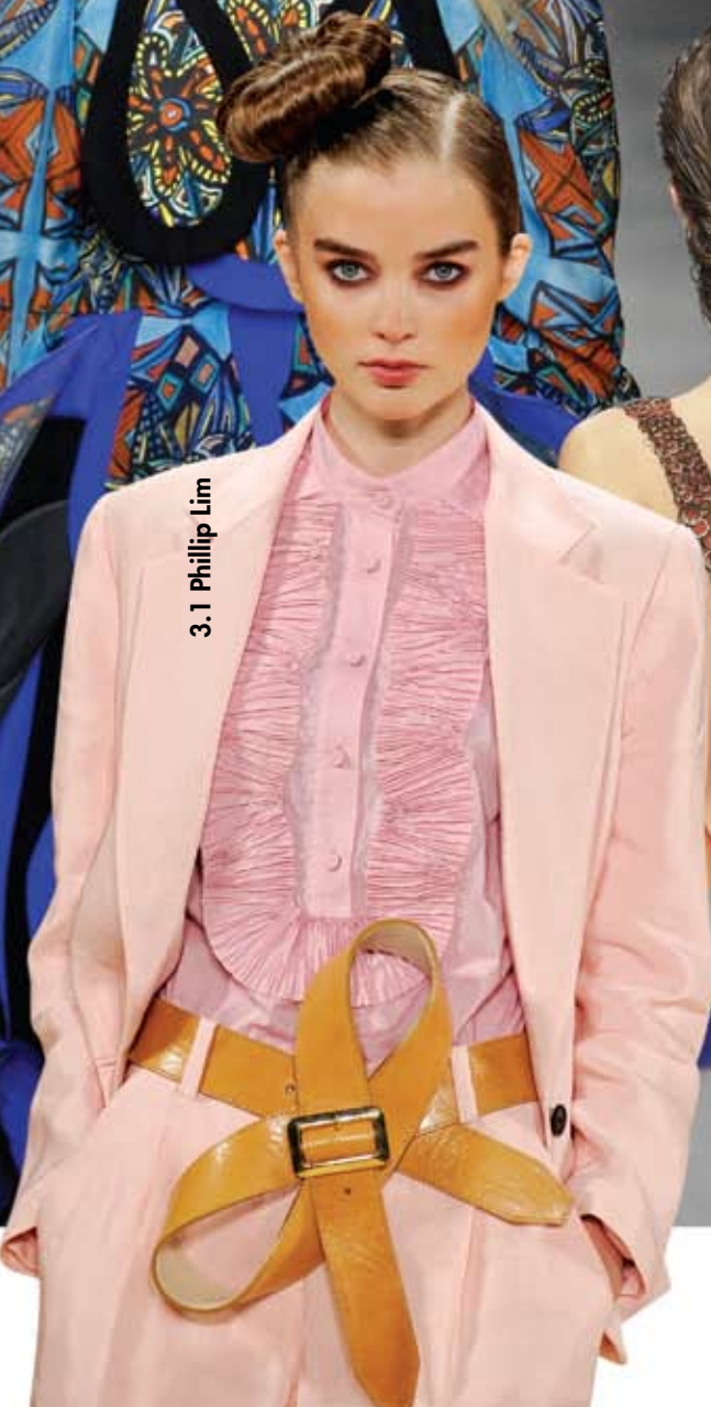
3.1 Phillip Lim