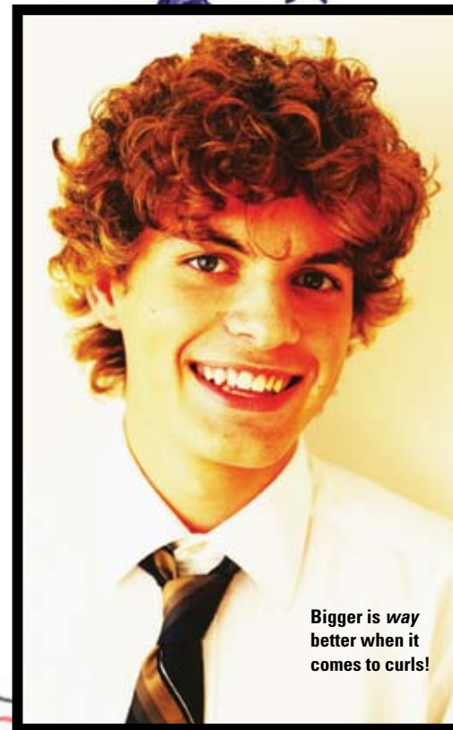
Bigger is way better when it comes to curls!