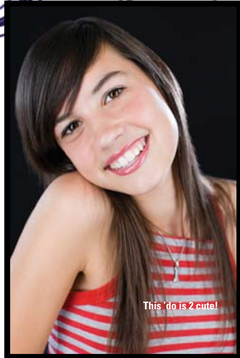
This 'do is 2 cute!

Whatever their music affiliation, gender or clique, all adolescents have one thing in common: They need to, like, find themselves. When I was 15 this soul searching led me to having a friend shave my hair from the tops of my ears down to my nape. Obviously, I was in full rebellion mode and wanted everyone to know it! I'll never forget when my friend first fired up the clipper; the buzzing fueled and broadcast my excitement and fear. Although I didn't keep the hairstyle for very long, the impression it made on everyone—especially me—was lasting.