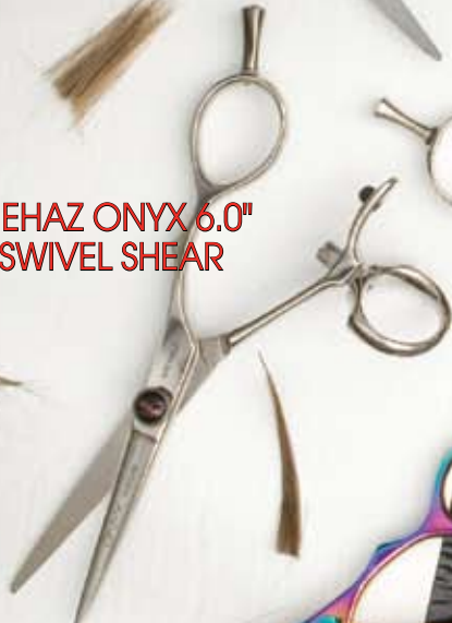
MEHAZ ONYX 6.0" SWIVEL SHEAR