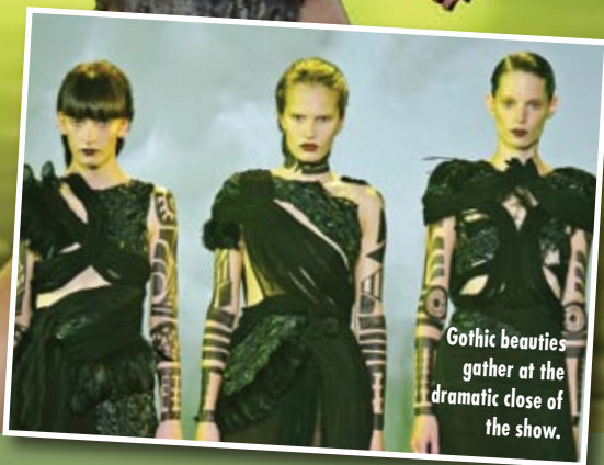
Gothic beauties gather at the dramatic close of the show.